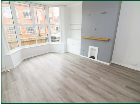
GROUND FLOOR 504 sq.ft. (46.8 sq.m.) approx.